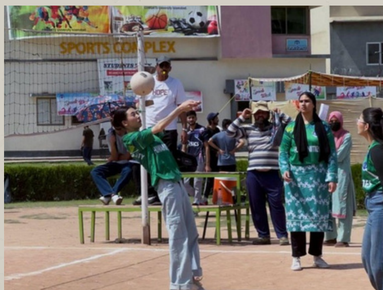
Humanities player in action during volleyball match against Economics.

The Humanities Department's girls' volleyball team began their tournament journey with a stunning performance, delivering a straight-sets victory over the Economics Department in what turned out to be one of the most exhilarating matches of the day. The stands were filled with cheering students and faculty, all eager to witness this much-anticipated showdown. With their green jerseys gleaming in the sun and determination etched on their faces, the Humanities team set the tone for the match from the very first whistle.