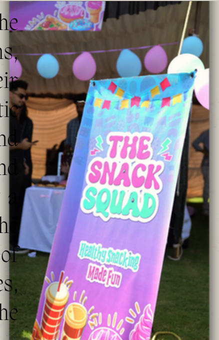
The snack squad stall at music and food fest

A highlight of the festival was the impromptu jamming sessions, where students showcased their musical talents. Enthusiastic attendees gathered around guitarists, singing along and playing instruments, fostering a sense of community and joy. The festival also offered a variety of food stalls with diverse cuisines, making it a feast for both the ears and taste buds.