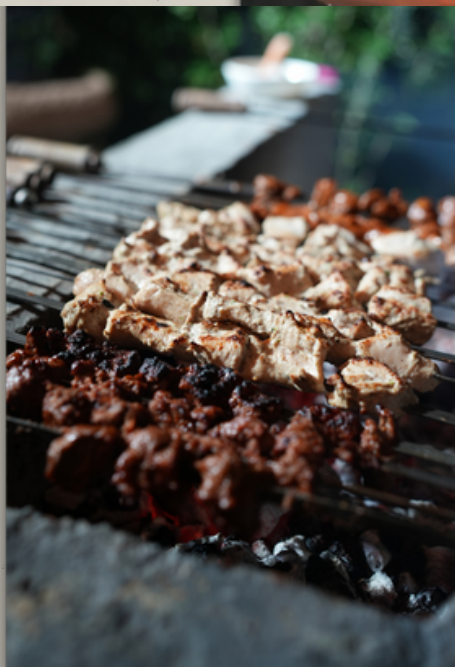
Food and songs in Music and food fest

. The Music and Food Festival aimed to celebrate creativity, talent, and social bonding among students. Held in a specially decorated open space on the COMSATS University Islamabad campus, the event brought a festive vibe to the university in April 2025. Organized to provide students with a break from academics, the festival encouraged creative expression and fostered a sense of community on campus. Student volunteers played a crucial role in managing performances, food stalls, and decor, with support from the university administration for logistics and promotion. "Strumming strings, good vibes, and savory delights — COMSATS Music and Food Fest 2025 unites students in a celebration of art, community, and culture!" The Music and Food Festival was a testament to the vibrant spirit of COMSATS University Islamabad, highlighting the creativity and camaraderie of its student body.