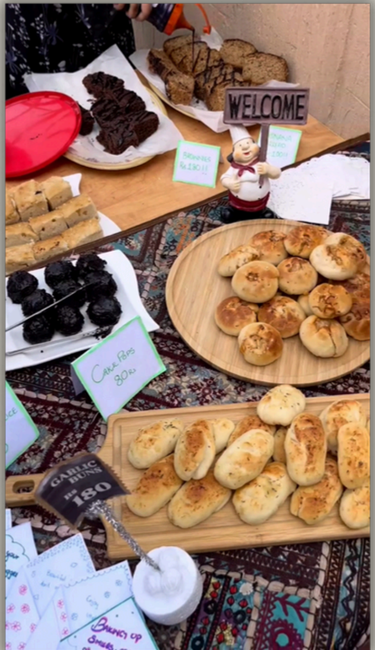
Buns and desert at bake sale

On April 21, 2025, the Psychology Society at COMSATS University brought the aroma of freshly baked goodies to campus with their much-anticipated bake sale. Held on the university grounds, the event showcased an array of delightful treats, including brownies, cake pops, banana bread, and garlic buns, among others. The vibrant stall, adorned with decorative signs and mouthwatering displays, attracted a steady stream of students and faculty eager to indulge their sweet tooth while supporting a good cause. The sale not only highlighted the culinary talents of the students but also served as an excellent platform for fostering community engagement and raising awareness about the society's initiatives. Whether it was the rich chocolatey goodness of the brownies or the savory allure of garlic buns, the bake sale left everyone with smiles and satisfied cravings. Kudos to the Psychology Society for organizing such a successful and enjoyable event.