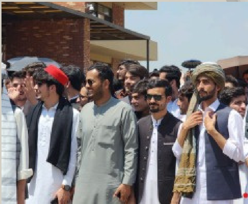
Students from the department gather for a photo after the cultural dance performances

The crowd was especially thrilled by the energetic Pakhtoon dance and the dramatic horse dance, both of which received enthusiastic applause. Meanwhile, media students captured every vibrant moment, documenting the sights and emotions that made the day truly memorable.