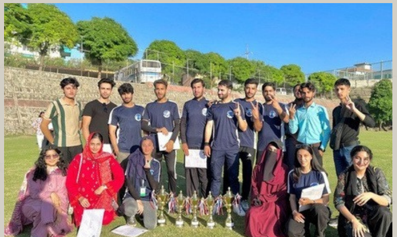
HUMANITIES SPORTS PERSONNELS