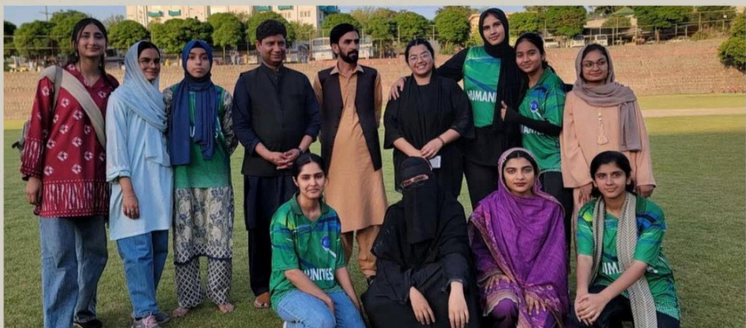
Victorious smiles as Humanities girls' volleyball team clinches first win over Economics.

Displaying exceptional teamwork, clear communication, and unshakable spirit, the Humanities team took control early and never looked back, wrapping up the match with set scores of 15-9 and 15-12. The court buzzed with excitement as the players delivered powerful spikes, precise serves, and agile saves—each move reflecting their skill and determination.