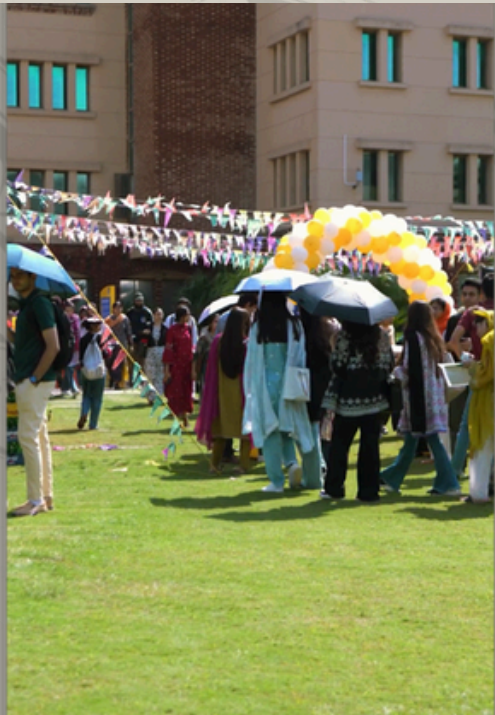
Inside the festivities of comsats

Zouq Mela, an annual celebration of creativity, entrepreneurship, and cultural diversity, featured various stalls showcasing handmade crafts, jewelry, home decor, clothing, paintings, and traditional food items. The winter season provided a perfect backdrop for a day brimming with lively activities and shopping opportunities. The primary aim of the mela was to offer students a platform to display their creative talents, encourage entrepreneurial initiatives, and promote cultural exchange and community engagement. The event was a collaborative effort between students and the university administration, resulting in a well-organized and enjoyable experience for all attendees. Visitors enjoyed live music, cultural performances, and a lively atmosphere that brought the community together.