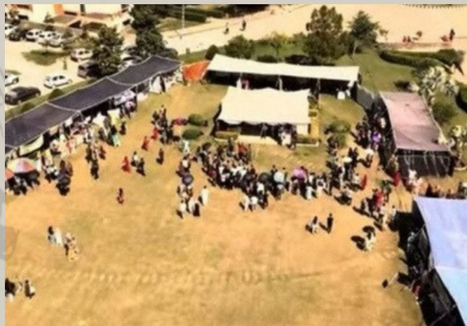
An aerial view of zouq mela

The EE Lawn offered a spacious and welcoming venue for the festivities, allowing for a seamless flow of activities and interactions. "Visitors explore colorful stalls at Zouq Mela 2025, held at the EE Lawn of COMSATS University Islamabad, celebrating creativity, culture, and student entrepreneurship." Zouq Mela 2025 was a testament to the vibrant spirit of COMSATS University Islamabad, showcasing the creativity and entrepreneurial spirit of its students while fostering a sense of community and cultural appreciation.